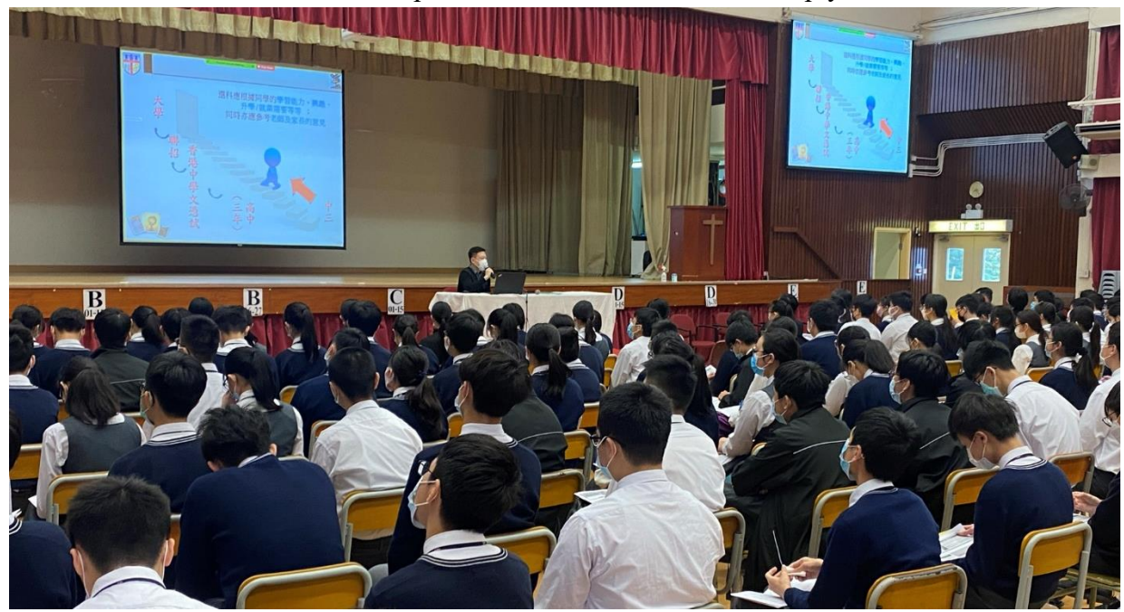
HKDSE Electives Information Day

- F.3 students had positive feedback on the CLP programmes and CLP teachers' counselling sessions. 86% of them agreed that the sharing given by their CLP teachers had alerted them to important issues about making choices of electives. 78% of the students agreed that the HKDSE Electives Information Day held on 27 March had furnished them with information about the contents and assessment criteria of different electives. 90% of them reported that the booklet prepared by the CLP Committee had alerted them to issues they had to pay special attention to when making electives choices and 70% of them thought that the counselling sessions with the CLP teachers had enabled them to ponder their electives choices deeply.