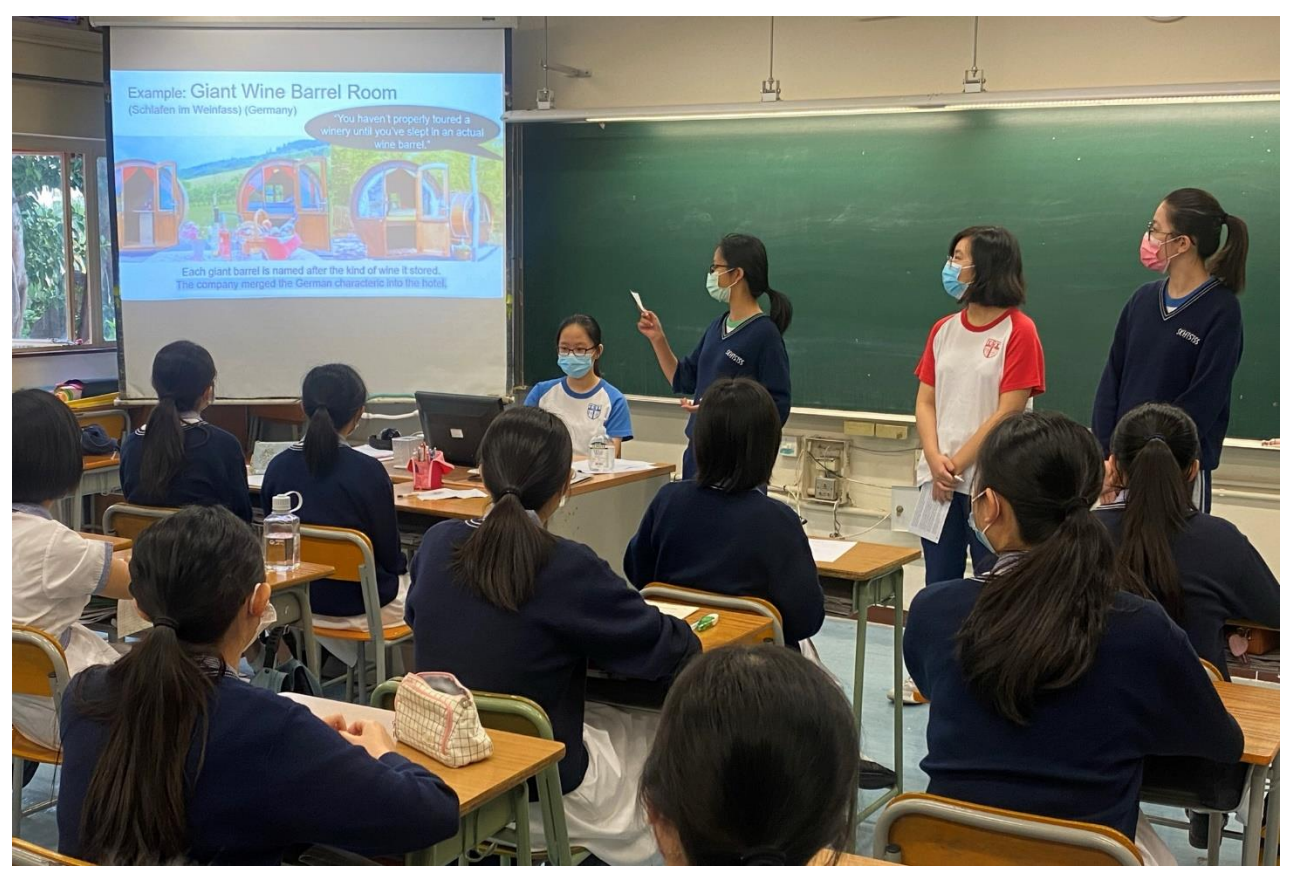
F.5 students doing their presentations in F.4 classes