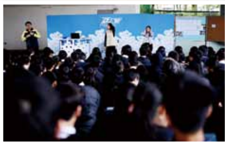
中三級同學觀賞話劇《鐵路戀曲》，陶醉其中。