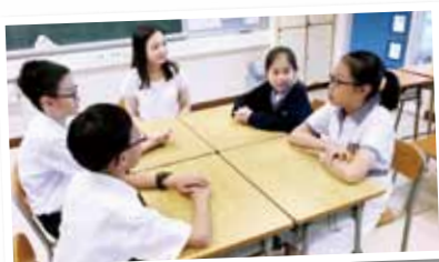
在「中一級學生關顧計劃」中，老師定期與中一同學面談，助學生更快適應中學生活。

本校訓導組負責統籌全校的訓育工作，例如設立學生長，督導學生遵守校規以及瞭解獎懲的意義和目標；貫徹「訓輔合一」的方針，對違規學生加以輔導，好讓他們知錯能改；本校所設計的德育課程則有效幫助學生認識自己，建立正確的人生觀及價值觀，學習立身處世之道。「中一級學生關顧計劃」與「大哥哥大姐姐計劃」更是特地為新入學的中一同學而設，希望藉此幫助他們適應中學的校園生活。