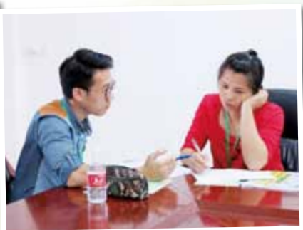
Our students were exchanging ideas with the teachers in Xinhui on English teaching.