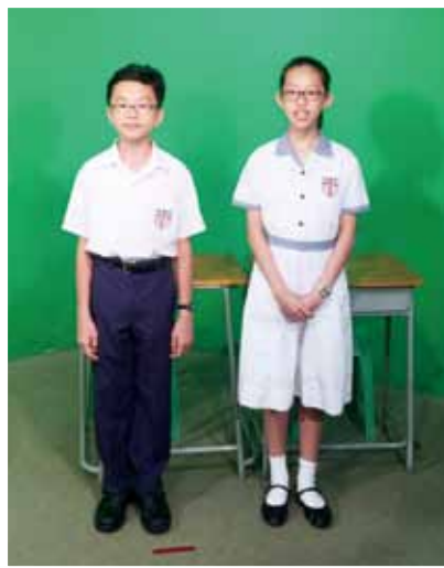
The Broadcast Room provides excellent training for budding journalists and actors, nurturing their creativity and proficiency in English and Putonghua.

The Campus TV provides English broadcasts regularly, which give students from each class ample opportunities to unleash their creativity and express their views on current affairs. IT Prefects also give technical support to students. Every year, over 80 Form 1 students are trained to be hosts of broadcast programmes. All these add up to a fruitful and colourful learning environment.