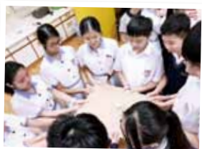
本校逢星期五放學後都會舉辦基督徒團契聚會，讓同學建立團契生活。