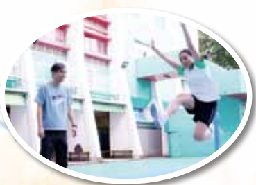
透過「一人一運動」計劃，中一同學可在課餘時候鍛練身體。圖中同學在老師指導下接受田徑訓練。

本校一直致力培養學生多方面的能力，例如自學、思考、探究、創新及應變。本校把全體學生分為智、毅、健、群四社，另設四十多個有關學術、興趣、服務、宗教及體育的學會，為學生提供多類型課外活動，讓他們發展多元智能，邁向全人教育的理想。本校老師還經常帶領學生參加不同的計劃和比賽，讓同學增廣見聞，發展所長。初中的同學更能透過「一人一運動」、「一人一藝術」和「一人一服務」計劃，發展體藝方面的潛能以及提升對社會的責任感。