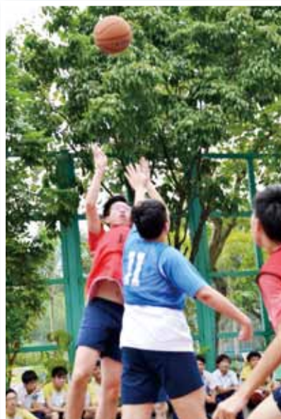
同學在社際籃球比賽一展所長。

本校提倡六育「德、智、體、群、美、靈」，對學生的體能發展相當重視。除了每年舉辦陸運會外，更在中一級推行「一人一運動」計劃，讓同學享受不同運動的樂趣，有助培養他們終身運動的習慣。