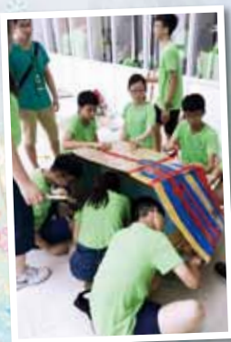
同學們正在自製載人船舶，領略科技奧妙。