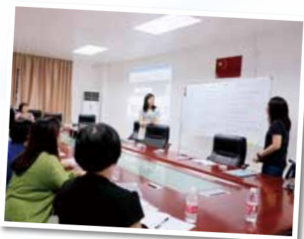
Our students and the teachers in Xinhui were working on a musical.