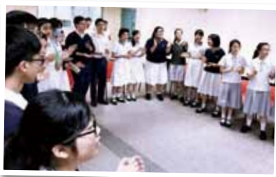
本校與林裘謀中學於靈風堂舉行聯合團契活動，一同敬拜上主。