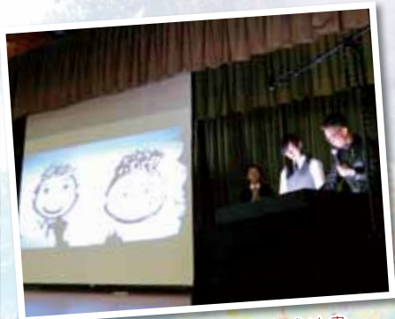
同學在台上與嘉賓合作完成沙畫，即場發揮藝術才華。