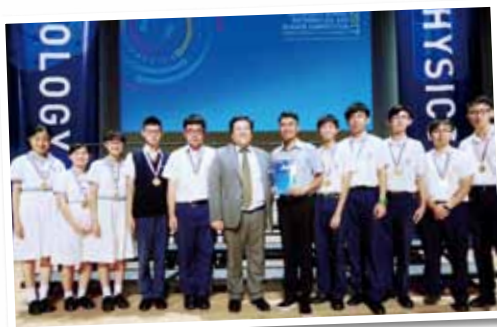
Over 60 Form 5 students participated in the Secondary School Mathematics and Science Competition 2017, organized by the Hong Kong Polytechnic University. More than half of them were awarded Medals and High Distinctions in Physics, Chemistry, Biology and Mathematics.