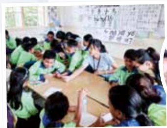
本校同學化身導師，教導柬埔寨的小學生普通話。

「讀萬卷書不如行萬里路」，本校一直鼓勵同學豐富課外學習經歷，並舉辦不少遊學團，以擴闊同學的視野、增廣其見聞。同學們亦積極參與活動，更會於早會時段和大家分享遊學經歷。