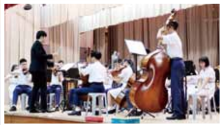
管弦樂團的同學在週會中為同學演奏美妙的樂曲。