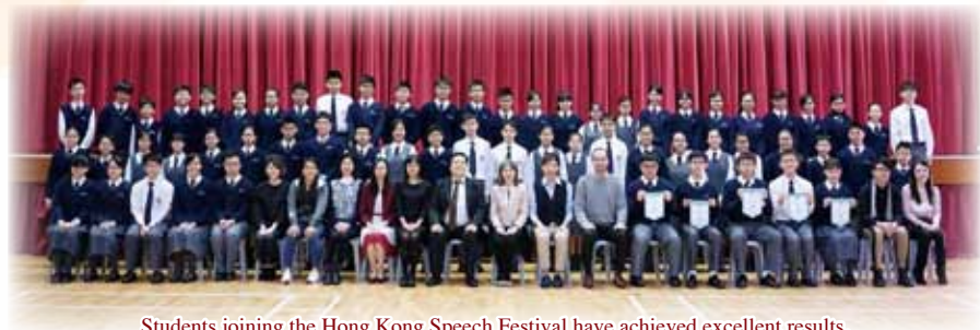
Students joining the Hong Kong Speech Festival have achieved excellent results.

Apart from attaining good grades in the public examination, students in our school also actively take part in different inter-school competitions, getting remarkable results.