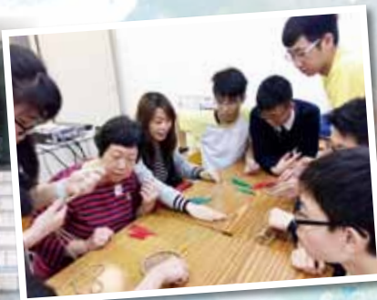
中四同學教導視障人士做手工藝，體會服務別人的意義。