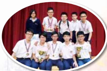
9 students joined the Association Cup 2017 Inter-School Scrabble Tournament organised by Hong Kong Scrabble Players Association. Our school got the 1st runner-up and 2nd runner-up in the junior and senior category. Individual awards, including the Best Players, were also awarded to our students.