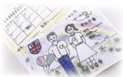
在「曾記存摺」活動中，同學學會尊師重道，成為具品德修養的學生。

S. K. H. Tsang Shiu Tim Secondary School