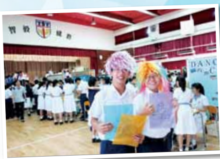
All F.1 students took part in the ECA Promotion Day at the beginning of the term to familiarize themselves with the extra-curricular activities provided by our school.