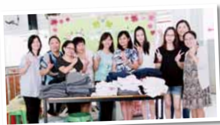
家長幫忙售賣二手校服，既能幫助有需要的同學，又能傳揚環保精神。