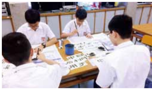
中二同學可在「一人一藝術」計劃中參與不同有關藝術的活動。圖中同學正練習書法，陶冶性情，盡展藝術才能。