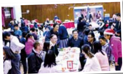
聖誕晚會上，同學和家長一邊品嚐美食，一邊欣賞精彩表演，共度佳節。

近年家長教師會更增設獎學金，用作獎勵男童軍、女童軍、航空青年團、紅十字會、學校概覽編委及家教會會刊編輯等服務優異之同學。