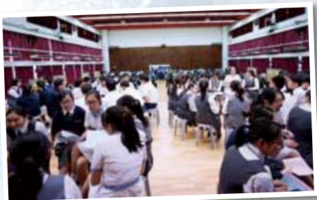
從事不同行業的校友出席升學及就業輔導日，同學把握機會發問，加深對各行各業的認識。