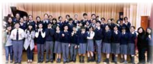
福音週期間，同學於禮堂參加敬拜讚美會，聆聽主的道。