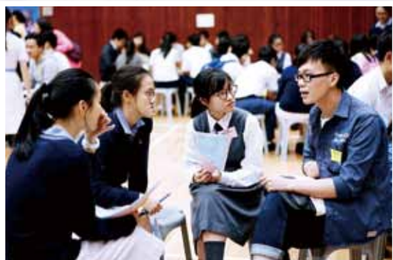
同學專心地聆聽校友分享升學與就業的心得，受益匪淺。

校友投身社會後，仍積極回饋母校，並協辦各類型校內活動，讓同學作多元化的發展。校友通過「職業及就業資料講座」以及接受訪問，與學弟妹分享升學、就業、面試技巧和人生經驗，使他們獲益良多。