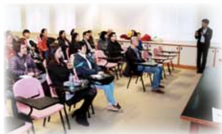
家長學堂中，講者向家長講授與子女溝通的技巧。