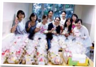
家長教師會悉心準備水果，聯同學生會代表於敬師日送給老師們，慰勞他們平日的辛勞。