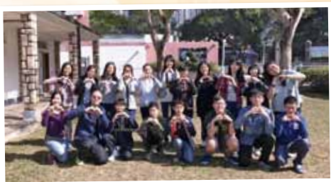
在靈風堂的同工和團契職員的帶領之下，中一和中二的同學在福音營裡進一步認識上帝。

本校的宗教活動注重個人生命培養，透過團契聚會、福音週及福音營等活動，讓學生有機會認識基督教信仰，從而引領學生歸主，牧養靈性。透過各類義賣及籌款活動，更可培養學生對不幸者的關懷和愛護，讓其體會「施比受更為有福」的真諦。本校設有小聖堂，為教職員和同學提供一個祈禱、默想和崇拜的地方，使他們在靈修生活中共沐主恩。