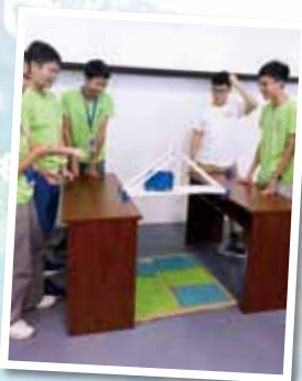
參加大連交流團的同學和當地同學研究「雲橋決斷術」。