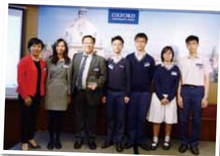
Over 1,600 junior secondary students entered the Junior Secondary Oxford English Writing Competition organized by Oxford University Press in January 2017. Our school won the "Most Active Participation Award".