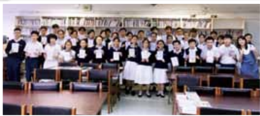
閱讀大使到各班分享自己喜愛的圖書，增加同學對閱讀的興趣。