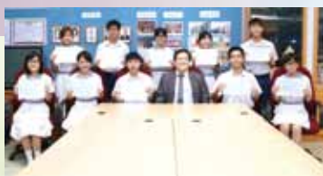
於第六屆中學文憑考試中取得卓越成績的同學們與校長合照。

（二零一六至二零一七年度）： 157 人應考，考獲入讀大學基本要求或以上的比率為 94.3% ，獲大學聯招派位的比率為 91.1% 。各科平均取得 5 級或以上的比率達 37.7% 。