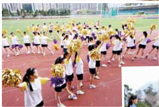
毅社啦啦隊投入地為運動員打氣。