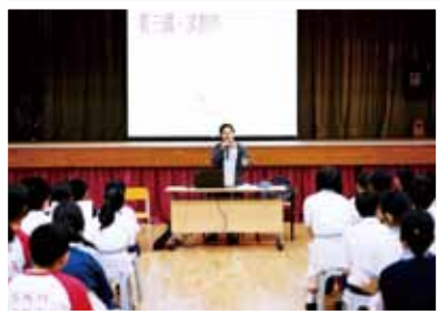
本校為中一同學舉辦「看三國，談創作」講座，同學獲益良多。