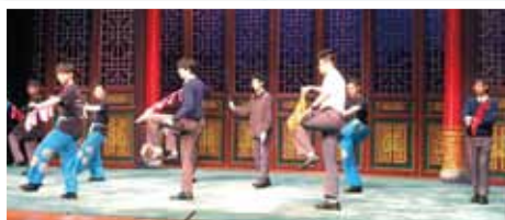
中四級同學到沙田大會堂欣賞粵劇表演，並參與互動環節，加深同學對粵劇文化的認識。