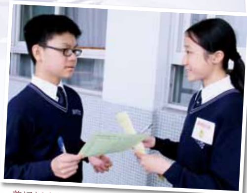
普通話大使活動增加同學練習普通話的機會。