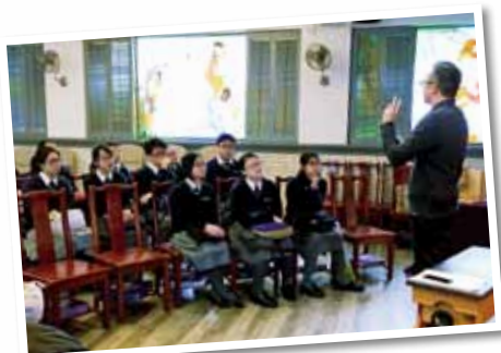
同學在鄧肇堅中學專心聆聽老師的講解，了解管風琴的特色。