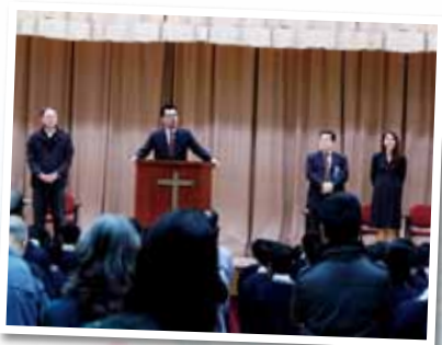
校友們在早會時段分享他們的人生經歷，給予同學們很大的啟發。