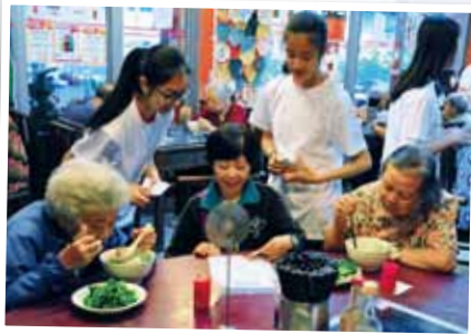
本校大哥姐參加了盛記麵家義賣活動，擔當侍應一職，服務本區的長者。