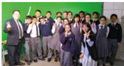
各班同學可輪流參與每週一次的英語廣播，中一同學更會擔任司儀一職。