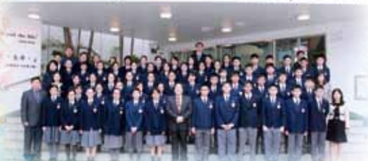
本校學生紀律嚴明，有賴學生長協助維持校園秩序，更為同學樹立良好榜樣。

S. K. H. Tsang Shiu Tim Secondary School