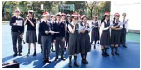
團契職員在校內和社區報佳音，紀念耶穌降生。