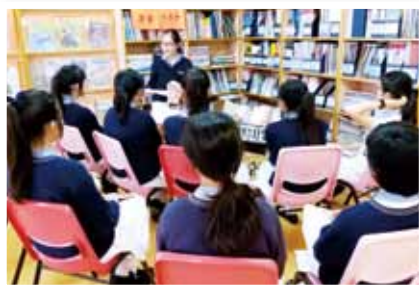
同學在漂書分享會中分享好書，彼此交流，拓闊閱讀視野。